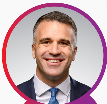
Peter Malinauskas, Premier of South Australia

This is a truly historic moment for education in South Australia.